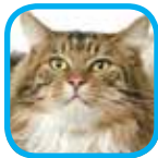
Furry or Feathered Animals