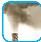
Outdoor Air Pollution and Weather