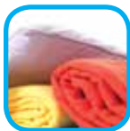
Dust and Dust Mites

The triggers below can make asthma worse. There are many easy and low cost things that childcare staff can do to reduce or get rid of asthma triggers in the childcare setting. By managing triggers, you can play a big role in preventing asthma attacks at your childcare site.