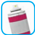
Perfumes, Odors and Strong Smells