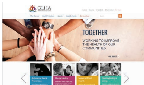
The new GLHA website, shown here, was launched in 2015.