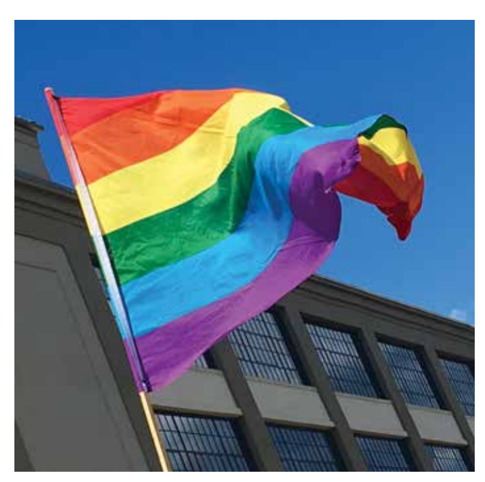
The LGBTQ flag flies proudly over Utopia Park during Pride Month.

This subcommittee addresses the potential risk facing members of the LGBTQ community by educating local businesses, community organizations, and health providers in the region so that they are better able to serve the LGBTQ community. The 2013 and 2016 Greater Lowell Community Health Needs Assessments revealed that members who are isolated or without family support are at risk of developing mental health, substance abuse,