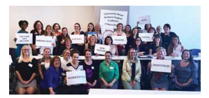
GLHA members attend Advanced Leadership Training: The Community-Based Perinatal Support Model, sponsored by MotherWoman Massachusetts Behavioral Health Partnership.

The Maternal Child Health Task Force brings together key stakeholders to address the most pressing health issues related to mothers and their families.