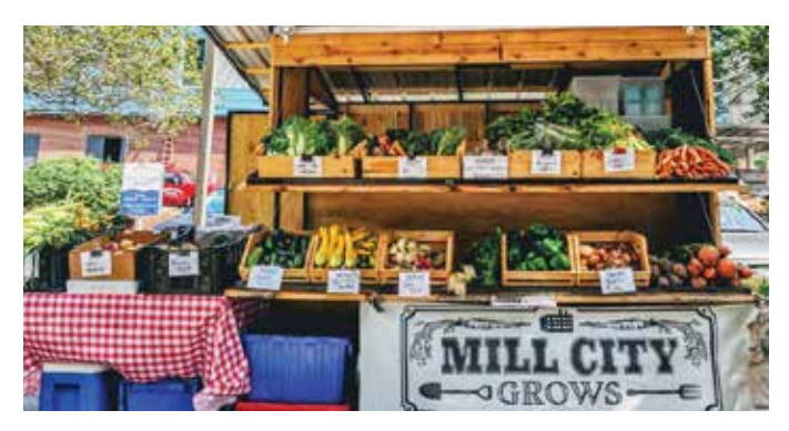
The Mill City Grows mobile markets offer fresh fruits and vegetables.

people attended and expressed interest in a Greater Lowell-based Blue Zones Project, which is a community-wide well-being initiative designed to make healthier choices easier. A steering committee was created to continue the discussion.