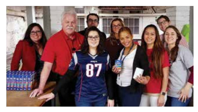
Volunteers from Lowell General Hospital and GLHA pack bags for the Merrimack Valley Food Bank Operation Nourish Project.

Regional Jail Diversion Program — $39,000