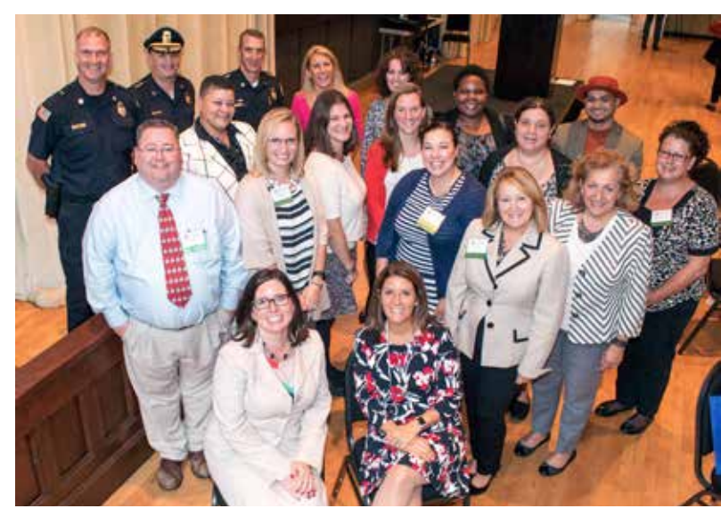
Recipients of the 2016/2017 Community Health Initiatives grants are helping to drive many of the GLHA task force initiatives.