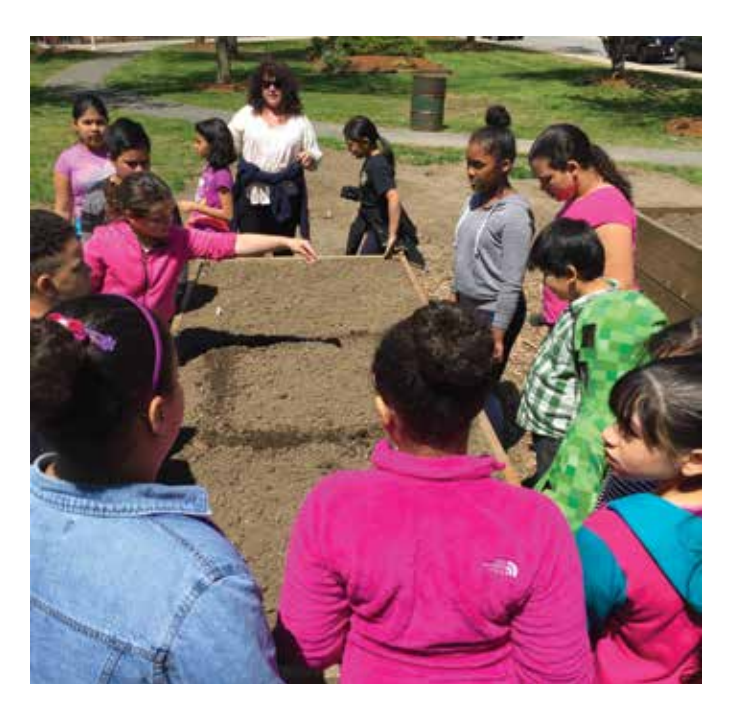
Children from McAvinnue Elementary School in Lowell enjoy planting through the Mill City Grows Farm To School Partnership Expansion Project.

As part of a new Neighborhood Revitalization Initiative program (NRI) in the Centralville neighborhood of Lowell, Habitat for Humanity is working to provide the opportunity of homeownership to low-income families. This grant enabled Habitat to renovate a decrepit house that was a blight on Dalton Street in Centralville into an affordable, homeowner-occupied home. Over the course of 2016, 559