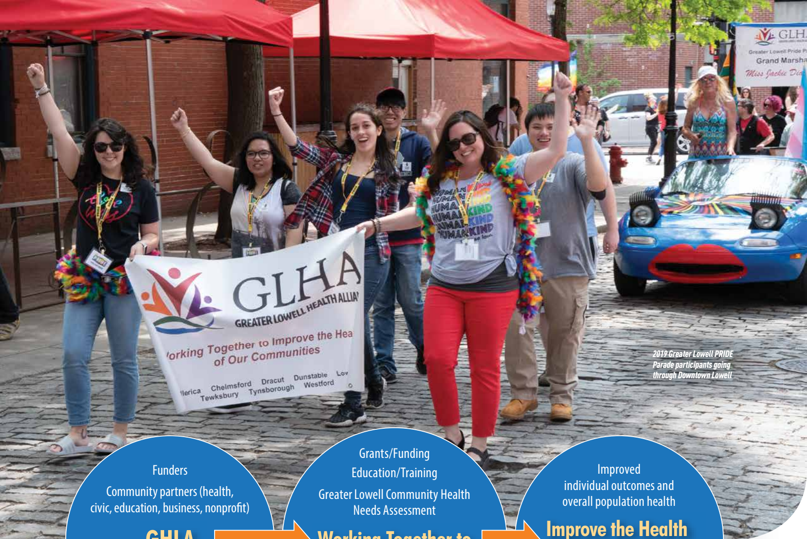
2019 Greater Lowell PRIDE Parade participants going through Downtown Lowell