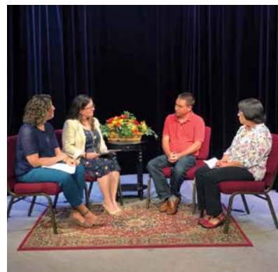
"Healthy Living in Lowell"

IMPACT HIGHLIGHT: Last year, the Substance Use & Prevention Task Force collaborated on the first annual Merrimack Valley Substance Use Disorder Symposium on December 7, 2018 at UTEC, with over 400 community members and partners attending. The Symposium served as a forum for all service providers, community members, and stakeholders to come together and discuss what is available and what is lacking in the realm of substance use prevention and where efforts need to be allocated to address this crisis. The second annual Merrimack Valley Substance Use Disorder Symposium will take place on December 6, 2019.