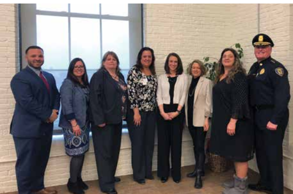
Innovative Transportation Efforts breakfast panel