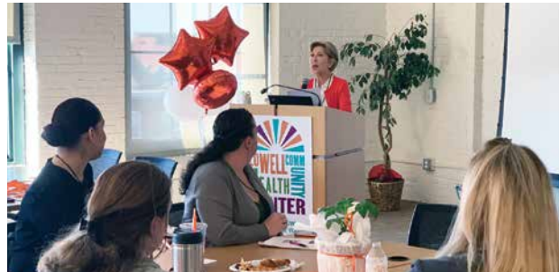
Lowell Medical Assistant Day Institute

The GLHA's six health-focused task forces—Cultural Competency, Healthy Eating & Active Living, Maternal Child Health, Mental Health, Social Determinants of Health, and Substance Use and Prevention—have adopted the CHIP as the driving force behind their efforts, creating working groups to set goals and objectives targeting specific areas of focus identified in the CHIP process.