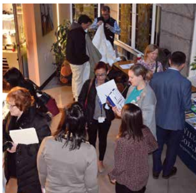
Substance Use Disorder Symposium

IMPACT HIGHLIGHT: The GLHA held a Networking Breakfast on March 22 titled "Innovative Transportation Efforts," hosted by the Lowell Community Health Center. Attendees learned about new projects and strategies to provide accessible and affordable transportation to residents. Panel members included Community Teamwork Inc., Elder Services of the Merrimack Valley, Merrimack Valley Project, and the Tewksbury Police Department.