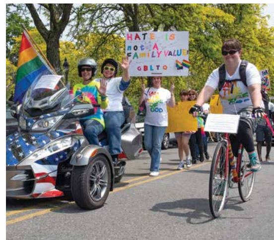
Lowell PRIDE 2019

IMPACT HIGHLIGHT: On May 31, 2019, the LGBTQ Subcommittee held the second annual Lowell PRIDE flag raising at City Hall in Lowell to celebrate our LGBTQ community and the beginning of PRIDE Month. Following the flag raising was our PRIDE Parade and Festival on June 1st at Middlesex Community College which saw over 500 people in attendance.