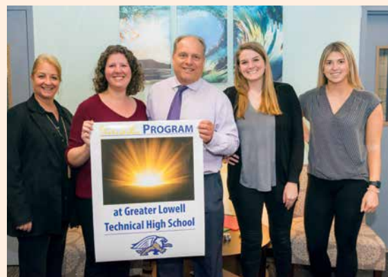
Left: Local families participating in the Mill City Grows' Farm to Table program. Middle: Graduates of a 2019 training for the Boys & Girls Club of Greater Lowell Emotional CPR (eCPR) program. Right: Greater Lowell Technical High School's RISE (Resilience in Student Effort) Classroom Opening for the 2019 school year.